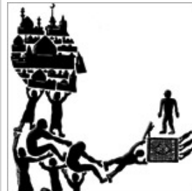
Op-Ed: President Apostate?