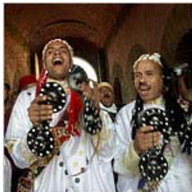
Rockin' the Casbah